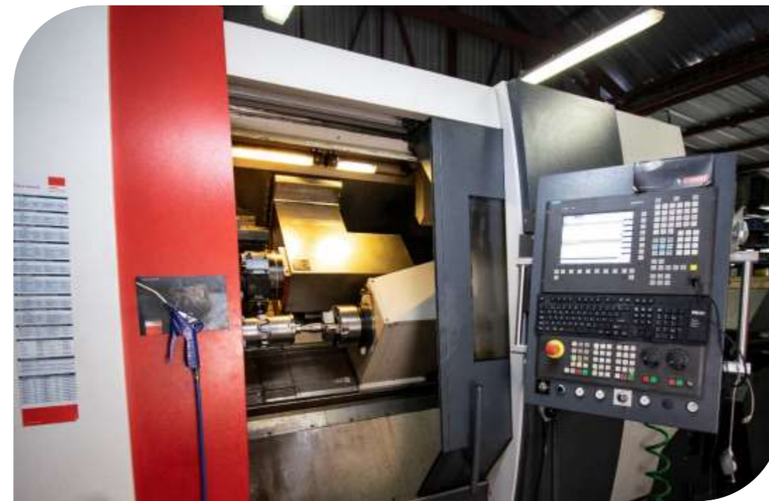
CNC Universal Lathe Center

KF5600 4 axis CNC vertical machining center operated by NX CAM CAD CAM software