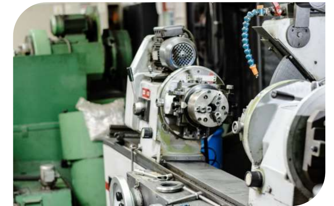
Axis Grinding Machine

Variety of conventional german machinery