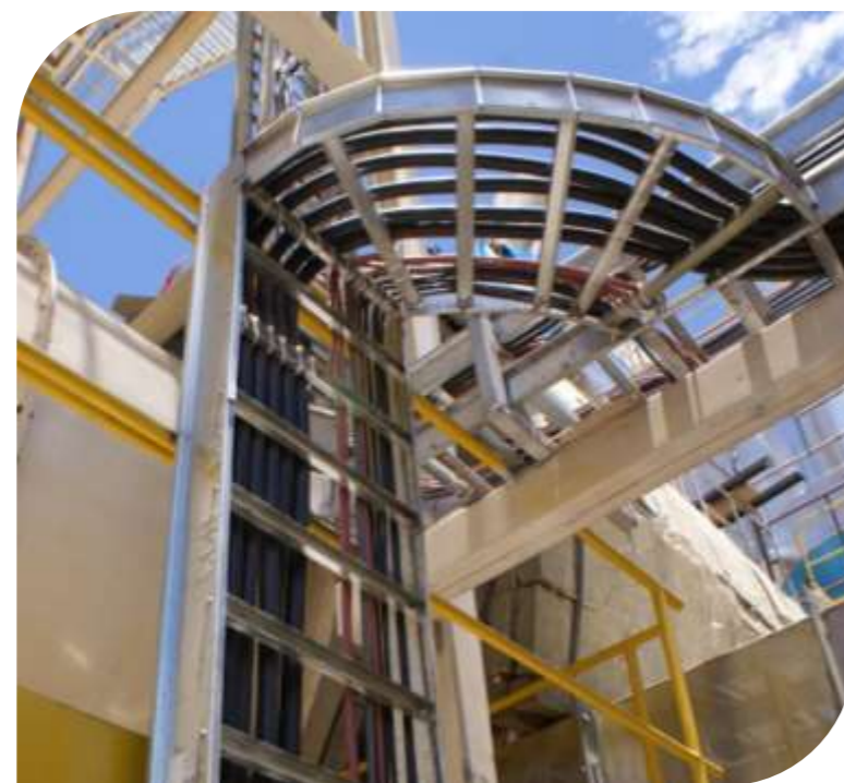
Steel Standard Products

Our integral solutions have no limits. At Sedemi, we have consolidated a wide variety of complementary products and services to cover the needs that arise in infrastructure projects in different sectors.