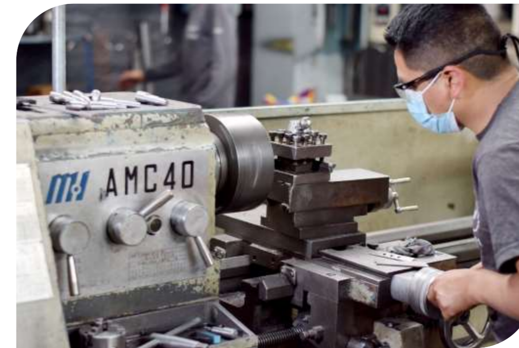
Conventional Lathes and Mills

Emco MaxxTurn 65-1000 Lathe Center is operated by ESPRIT CAM CAD CAM software