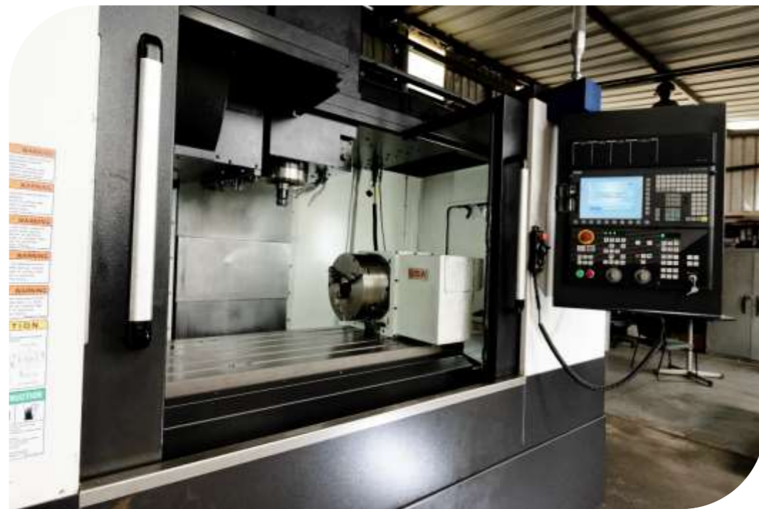
Hyundai Machining Center

We have state-of-the-art technology available to all sectors that simplify the manufacturing processes of mechanical components. We are a benchmark in carrying out complex projects with high added value and high precision.